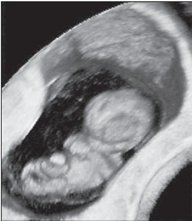
Ultrasound of a 9-week unborn child